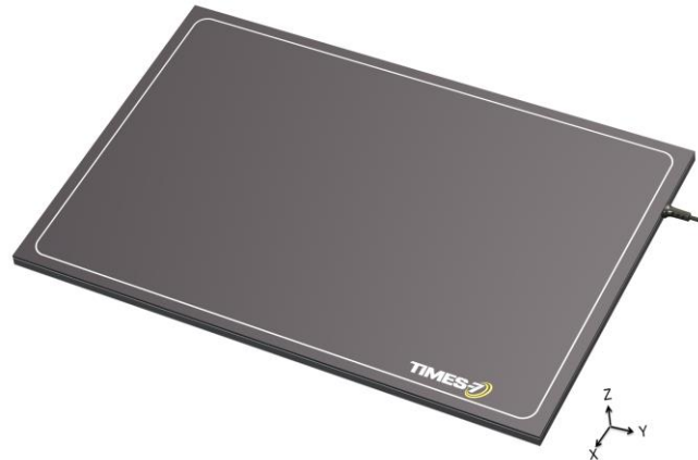
The SlimLine A7040

Ultra-low profile linear polarised flat panel antenna